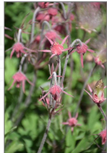
Prairie Smoke flower buds