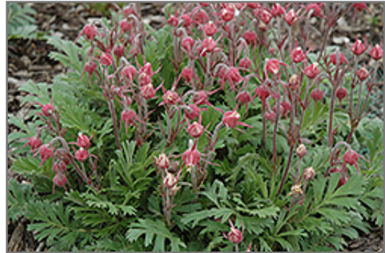
Prairie Smoke in bloom

Prairie Smoke is an herbaceous perennial with an upright spreading habit of growth. Its relatively fine texture sets it apart from other garden plants with less refined foliage.