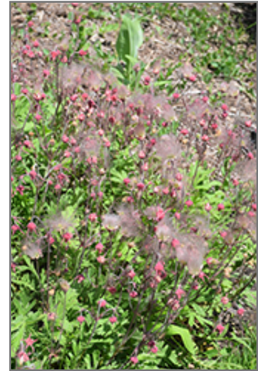
Prairie Smoke in bloom