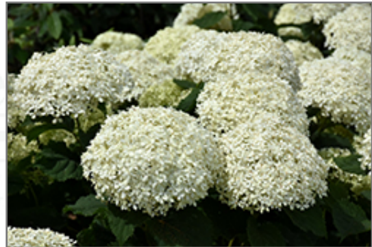
Invincibelle Limetta Hydrangea flowers