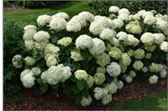
Invincibelle Limetta Hydrangea in bloom

Invincibelle Limetta Hydrangea is recommended for the following landscape applications;