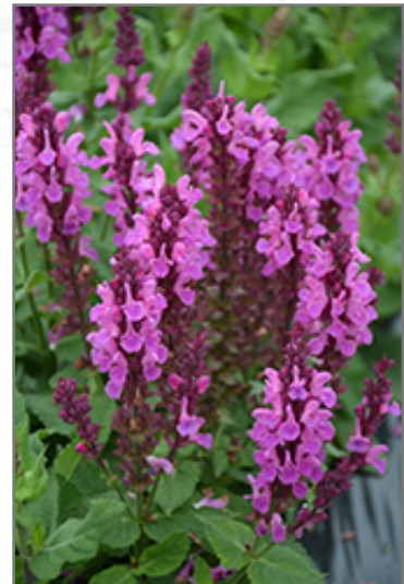
Rose Marvel Meadow Sage flowers