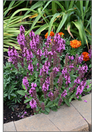
Rose Marvel Meadow Sage in bloom

Rose Marvel Meadow Sage will grow to be about 10 inches tall at maturity extending to 14 inches tall with the flowers, with a spread of 12 inches. When grown in masses or used as a bedding plant, individual plants should be spaced approximately 10 inches apart. It grows at a medium rate, and under ideal conditions can be expected to live for approximately 5 years. As an herbaceous perennial, this plant will usually die back to the crown each winter, and will regrow from the base each spring. Be careful not to disturb the crown in late winter when it may not be readily seen!