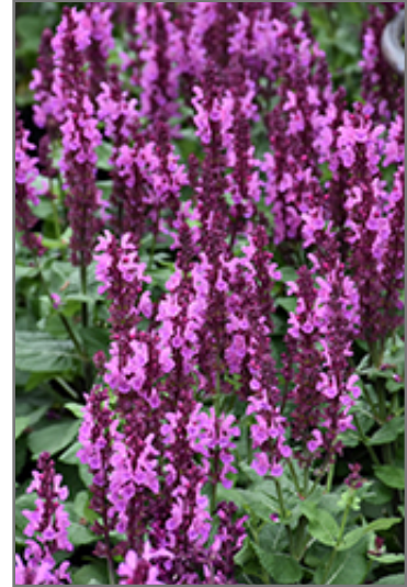
Rose Marvel Meadow Sage flowers

Rose Marvel Meadow Sage is an herbaceous perennial with an upright spreading habit of growth. Its relatively fine texture sets it apart from other garden plants with less refined foliage.