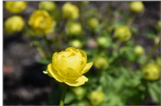
Lemon Supreme Globeflower flowers