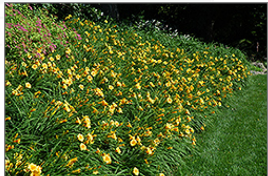
Happy Ever Appster Happy Returns Daylily in bloom