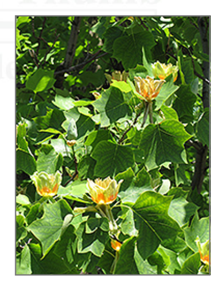
Tuliptree flowers