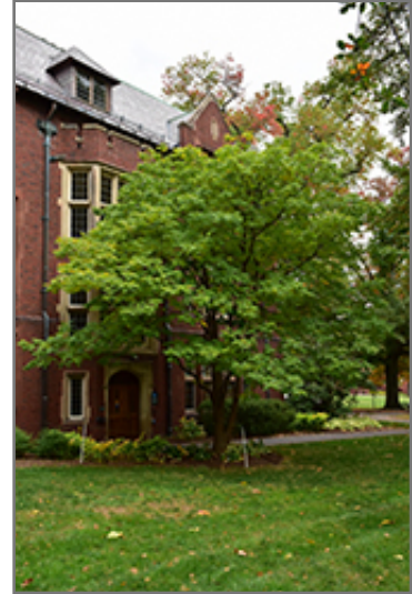
Amur Maackia

Amur Maackia is recommended for the following landscape applications;