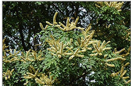
Amur Maackia flowers