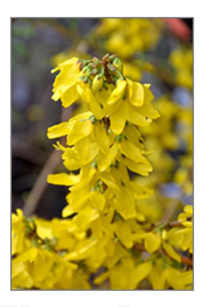
Magical Gold Forsythia flowers

Magical Gold Forsythia will grow to be about 6 feet tall at maturity, with a spread of 5 feet. It tends to fill out right to the ground and therefore doesn't necessarily require facer plants in front, and is suitable for planting under power lines. It grows at a medium rate, and under ideal conditions can be expected to live for approximately 30 years.