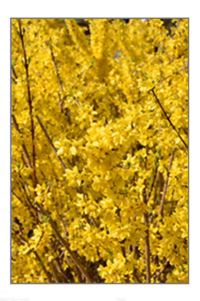
Magical Gold Forsythia flowers

Magical Gold Forsythia is a dense multi-stemmed deciduous shrub with a mounded form. Its average texture blends into the landscape, but can be balanced by one or two finer or coarser trees or shrubs for an effective composition.