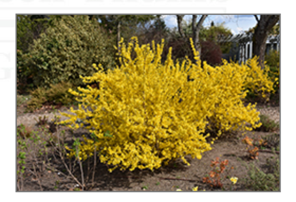
Magical Gold Forsythia in bloom