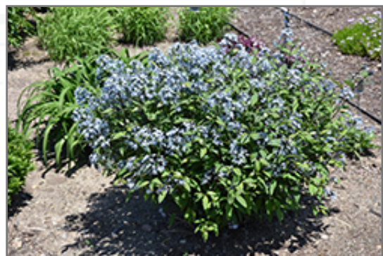
Storm Cloud Bluestar in bloom