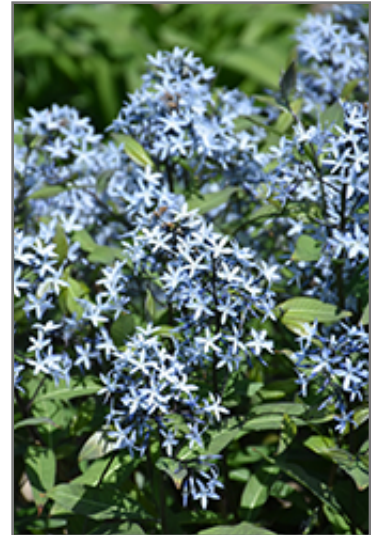
Storm Cloud Bluestar flowers

Storm Cloud Bluestar is an herbaceous perennial with a more or less rounded form. Its medium texture blends into the garden, but can always be balanced by a couple of finer or coarser plants for an effective composition.