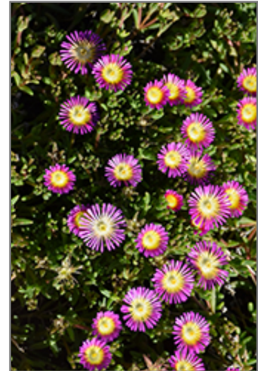
Wheels of Wonder Hot Pink Wonder Ice Plant flowers

A low growing succulent, native to South Africa but amazingly hardy in North America; dazzling hot pink daisy-like flowers with yellow centers; green foliage has burgundy overtones in fall; perfect for xeriscapes, rock gardens, screens and sandy soils