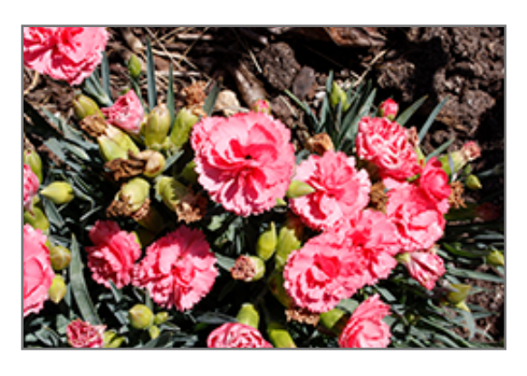
Fruit Punch Classic Coral Pinks flowers

Fruit Punch Classic Coral Pinks is an herbaceous evergreen perennial with a mounded form. It brings an extremely fine and delicate texture to the garden composition and should be used to full effect.