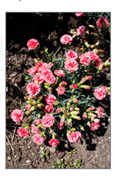
Fruit Punch Classic Coral Pinks in bloom