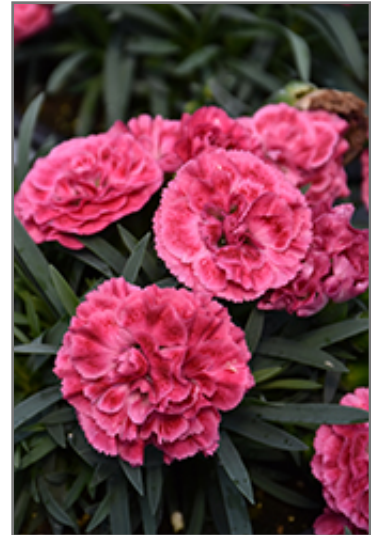
Fruit Punch Raspberry Ruffles Pinks flowers

Fruit Punch Raspberry Ruffles Pinks is an herbaceous evergreen perennial with a mounded form. It brings an extremely fine and delicate texture to the garden composition and should be used to full effect.