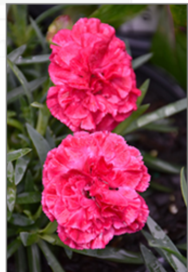
Fruit Punch Raspberry Ruffles Pinks flowers