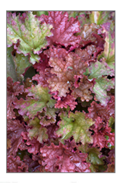
Peachberry Ice Coral Bells flowers

Peachberry Ice Coral Bells is a dense herbaceous evergreen perennial with tall flower stalks held atop a low mound of foliage. Its relatively fine texture sets it apart from other garden plants with less refined foliage.