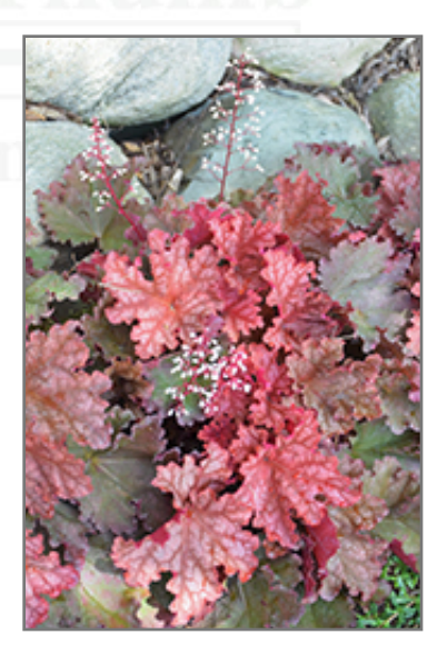
Peachberry Ice Coral Bells foliage