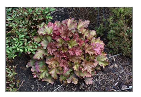
Peachberry Ice Coral Bells