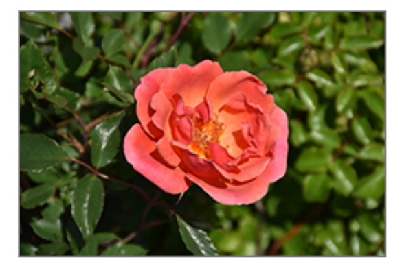
Coral Knock Out Rose flowers

Height: 5 feet Spread: 5 feet Sunlight: O Hardiness Zone: 5a Group/Class: Shrub Rose Description: One of the most popular roses