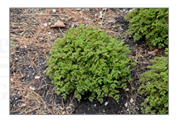
Chantilly Lace Goatsbeard

This is a relatively low maintenance plant, and is best cleaned up in early spring before it resumes active growth for the season. Deer don't particularly care for this plant and will usually leave it alone in favor of tastier treats. It has no significant negative characteristics.