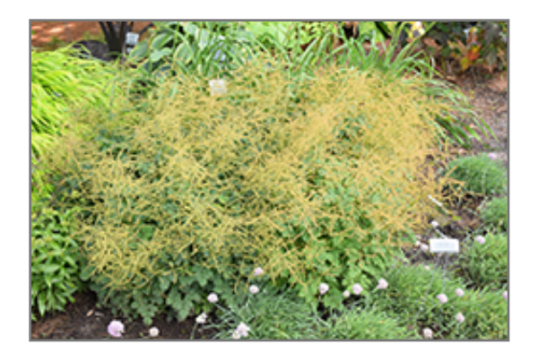
Chantilly Lace Goatsbeard flowers (faded)

Chantilly Lace Goatsbeard is an herbaceous perennial with a mounded form. Its relatively fine texture sets it apart from other garden plants with less refined foliage.