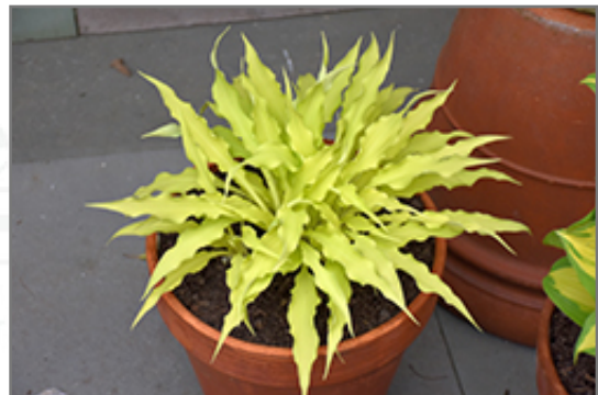
Wiggles and Squiggles Hosta