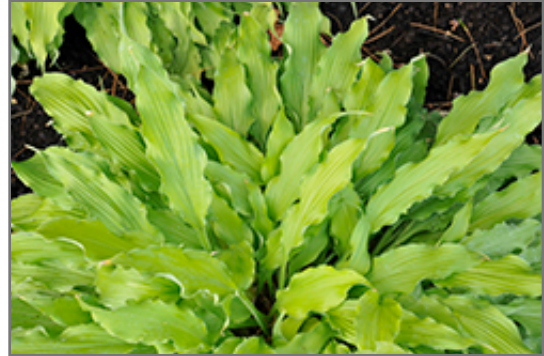
Wiggles and Squiggles Hosta foliage