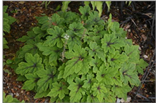
Fingerprint Foamflower

Fingerprint Foamflower is an herbaceous evergreen perennial with tall flower stalks held atop a low mound of foliage. Its medium texture blends into the garden, but can always be balanced by a couple of finer or coarser plants for an effective composition.