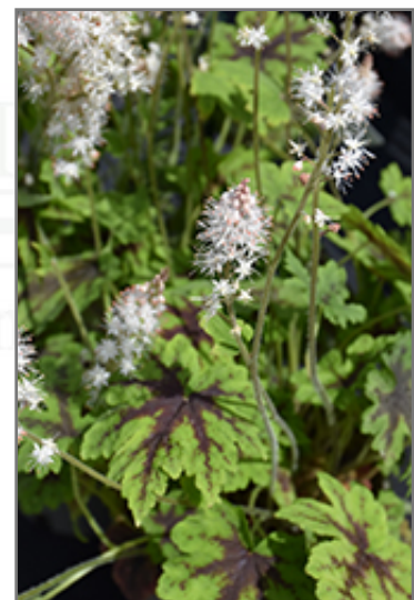
Fingerprint Foamflower flowers