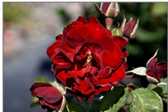
Navy Lady Rose flowers