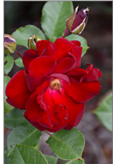
Navy Lady Rose flowers

Navy Lady Rose is a multi-stemmed deciduous shrub with an upright spreading habit of growth. Its average texture blends into the landscape, but can be balanced by one or two finer or coarser trees or shrubs for an effective composition.