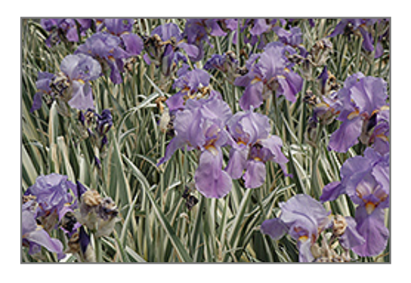
Variegated Sweet Iris flowers

Variegated Sweet Iris is an herbaceous perennial with an upright spreading habit of growth. Its medium texture blends into the garden, but can always be balanced by a couple of finer or coarser plants for an effective composition.