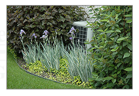
Variegated Sweet Iris

This plant will require occasional maintenance and upkeep, and should be cut back in late fall in preparation for winter. Deer don't particularly care for this plant and will usually leave it alone in favor of tastier treats. Gardeners should be aware of the following characteristic(s) that may warrant special consideration;