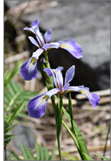
Blue Flag Iris flowers