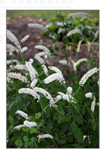
American Bugbane flowers