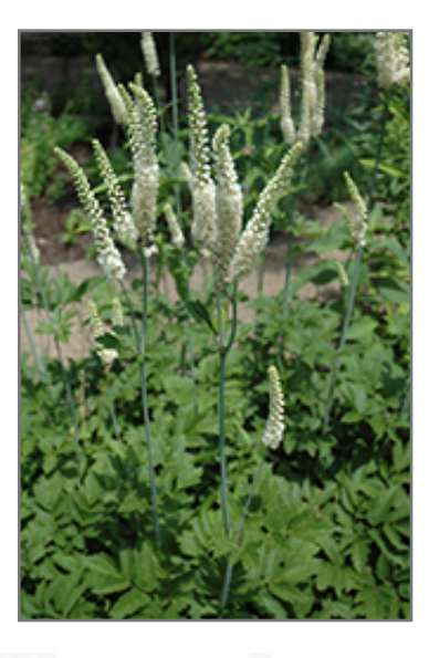
American Bugbane in bloom

American Bugbane is recommended for the following landscape applications;