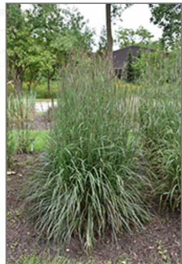
Blackhawks Bluestem in bloom