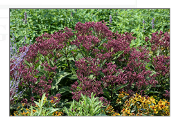
Euphoria Ruby Joe Pye Weed in bloom