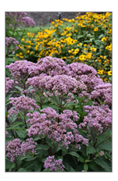
Euphoria Ruby Joe Pye Weed flowers

Euphoria Ruby Joe Pye Weed is an herbaceous perennial with an upright spreading habit of growth. Its wonderfully bold, coarse texture can be very effective in a balanced garden composition.