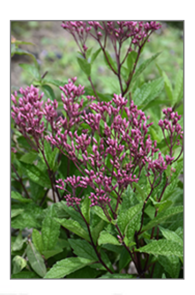
Euphoria Ruby Joe Pye Weed flowers

Euphoria Ruby Joe Pye Weed will grow to be about 26 inches tall at maturity, with a spread of 28 inches. When grown in masses or used as a bedding plant, individual plants should be spaced approximately 24 inches apart. It tends to be leggy, with a typical clearance of 1 foot from the ground, and should be underplanted with lower-growing perennials. It grows at a medium rate, and under ideal conditions can be expected to live for approximately 15 years. As an herbaceous perennial, this plant will usually die back to the crown each winter, and will regrow from the base each spring. Be careful not to disturb the crown in late winter when it may not be readily seen!