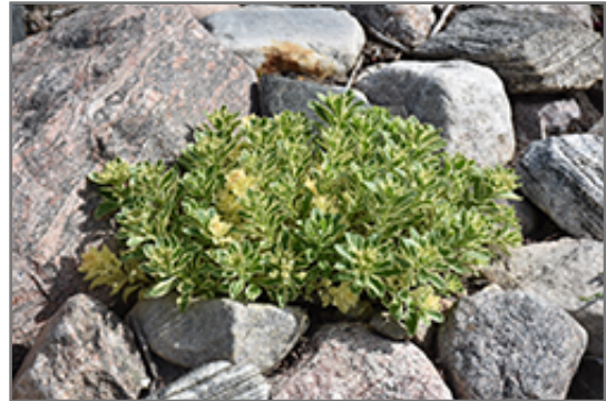
Atlantis Stonecrop