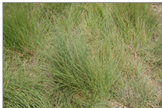
Blue Grama