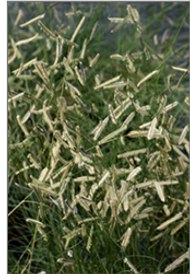
Blue Grama flowers

This is a relatively low maintenance plant, and is best cleaned up in early spring before it resumes active growth for the season. It is a good choice for attracting birds to your yard. Gardeners should be aware of the following characteristic(s) that may warrant special consideration;