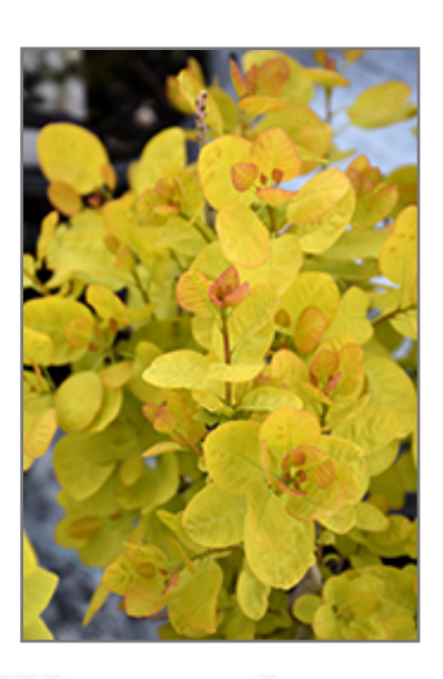
Winecraft Gold Smokebush foliage

A bold, bright and beautiful color accent for the garden, this shrub features orange emerging foliage that takes on a golden hue, then matures to chartreuse; smoky, airy plumes of green to pink cover the plant from early to mid-summer