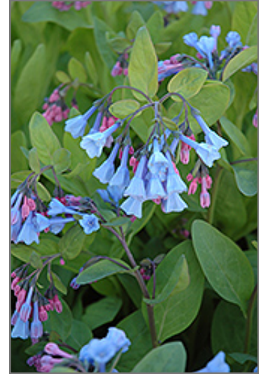
Virginia Bluebells flowers