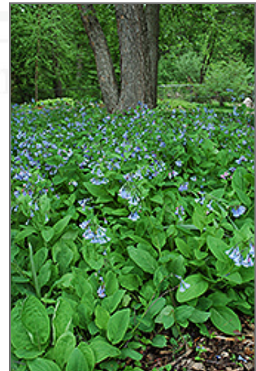
Virginia Bluebells in bloom