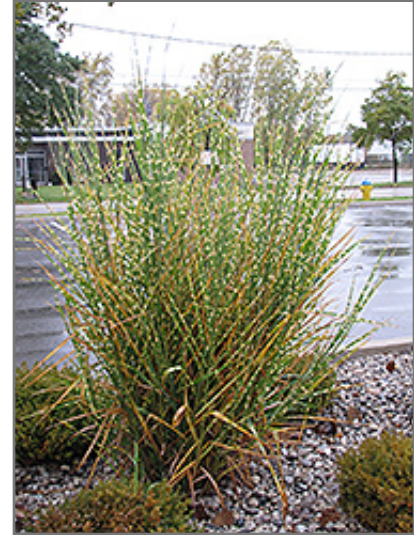
Porcupine Grass

Porcupine Grass is recommended for the following landscape applications;