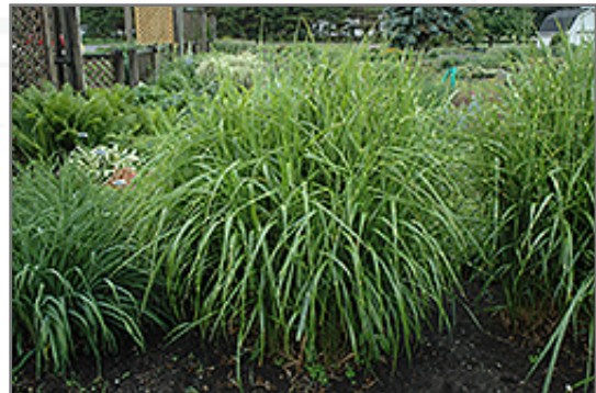
Porcupine Grass