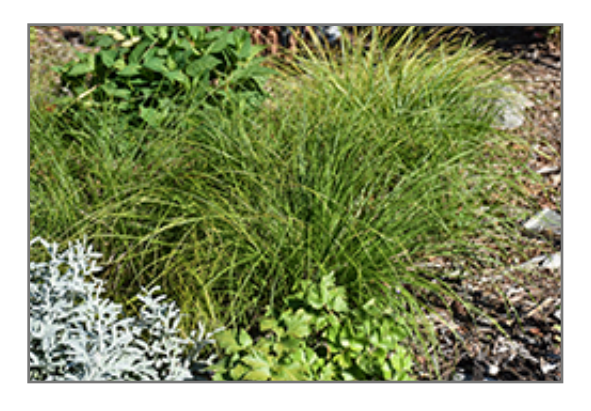
Pennsylvania Sedge

Pennsylvania Sedge is recommended for the following landscape applications;