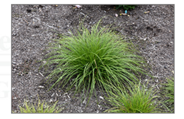
Pennsylvania Sedge