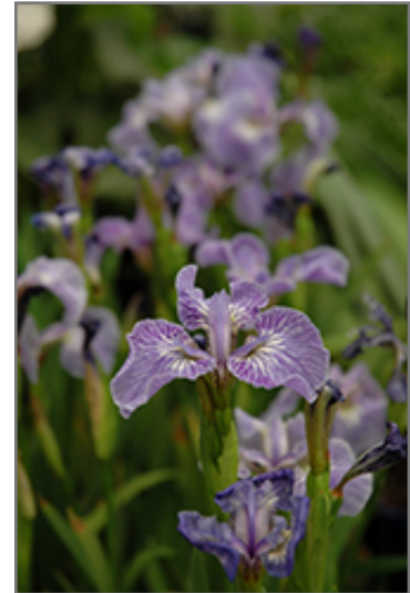
Dwarf Arctic Iris flowers

This short, dwarf iris features lovely lavender-blue blooms, with dark purple veining, rising just above the foliage; an interesting addition to border fronts; also excellent massed in groupings in the garden; will eventually form dense colonies