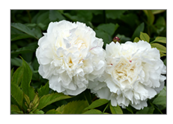
Duchesse de Nemours Peony flowers

Duchesse de Nemours Peony features bold fragrant double creamy white flowers with gold centers at the ends of the stems from late spring to early summer. The flowers are excellent for cutting. Its compound leaves remain green in colour throughout the season.