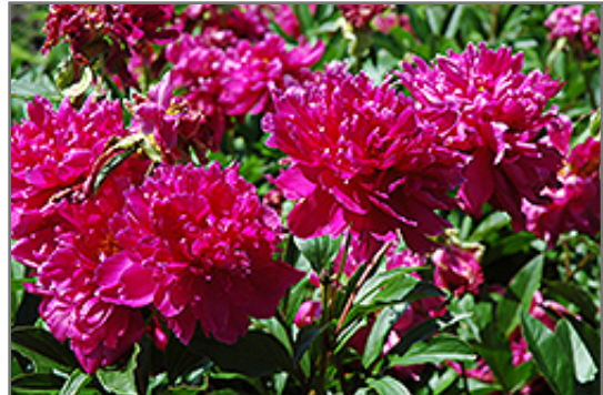
Karl Rosenfield Peony flowers