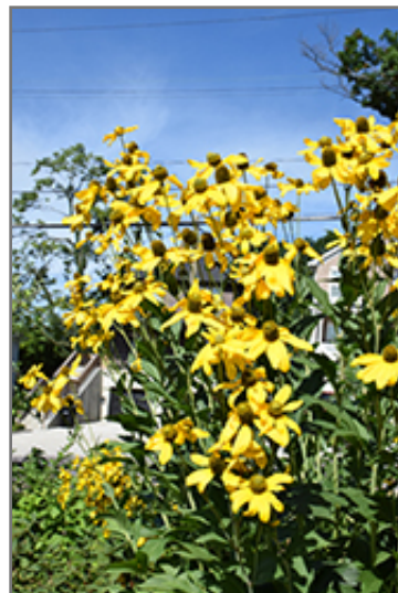
Herbstsonne Coneflower flowers

This is a relatively low maintenance plant, and should be cut back in late fall in preparation for winter. It is a good choice for attracting bees and butterflies to your yard, but is not particularly attractive to deer who tend to leave it alone in favor of tastier treats. It has no significant negative characteristics.