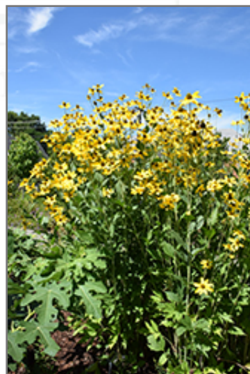
Herbstsonne Coneflower in bloom