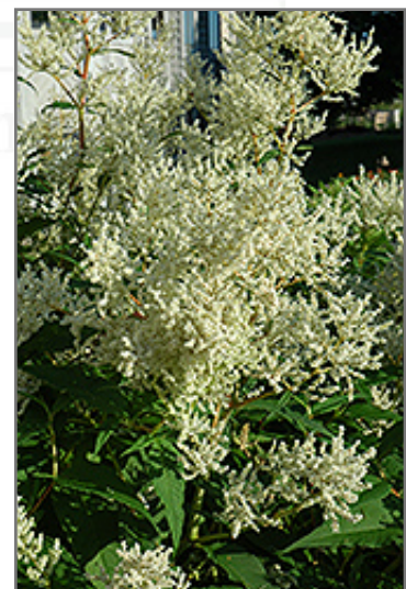
White Fleecflower flowers