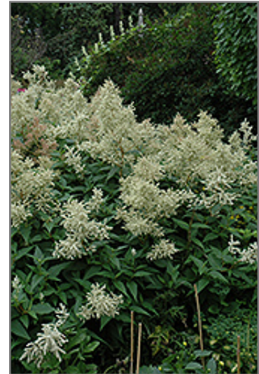
White Fleecflower in bloom