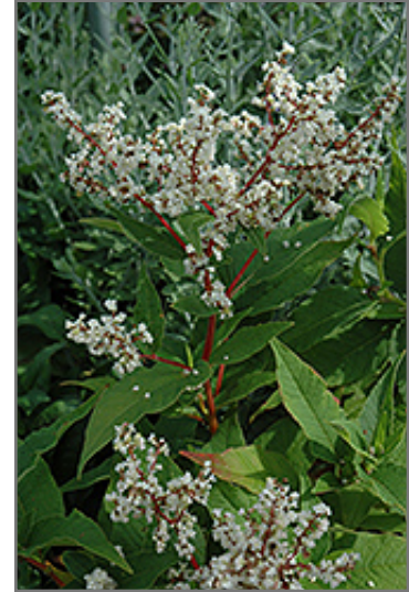
White Fleeceflower flowers

This plant does best in full sun to partial shade. It prefers to grow in average to moist conditions, and shouldn't be allowed to dry out. It is not particular as to soil type or pH. It is highly tolerant of urban pollution and will even thrive in inner city environments. This species is not originally from North America. It can be propagated by division.