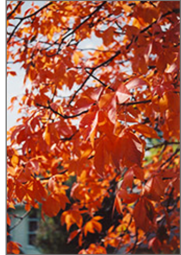
Ohio Buckeye in fall

This tree does best in full sun to partial shade. It prefers to grow in average to moist conditions, and shouldn't be allowed to dry out. It is not particular as to soil type or pH. It is highly tolerant of urban pollution and will even thrive in inner city environments. This species is native to parts of North America.