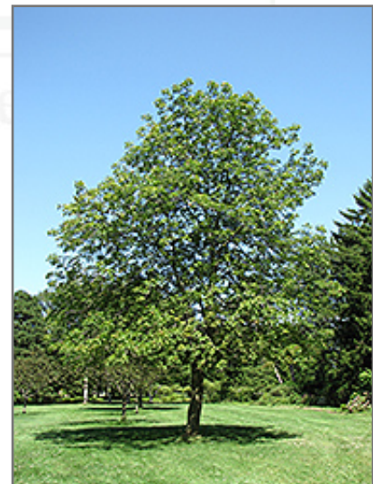
Ohio Buckeye