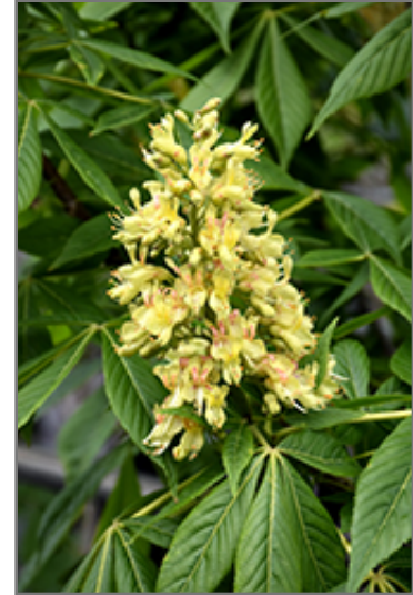
Ohio Buckeye flowers

Ohio Buckeye is recommended for the following landscape applications;