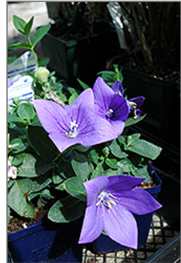
Astra Blue Balloon Flower flowers