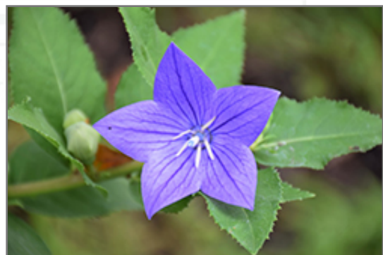
Astra Blue Balloon Flower flowers