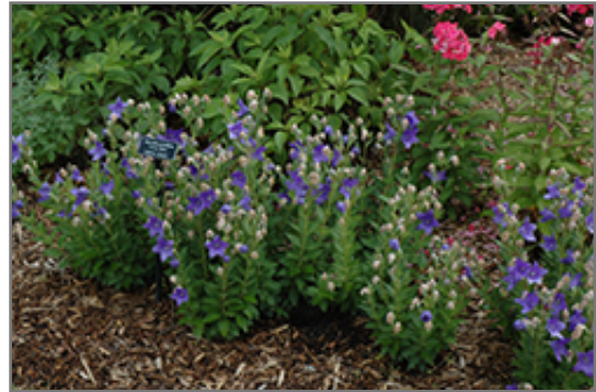
Astra Blue Balloon Flower in bloom

Astra Blue Balloon Flower will grow to be about 12 inches tall at maturity, with a spread of 12 inches. When grown in masses or used as a bedding plant, individual plants should be spaced approximately 9 inches apart. Its foliage tends to remain dense right to the ground, not requiring facer plants in front. It grows at a medium rate, and under ideal conditions can be expected to live for approximately 10 years. As an herbaceous perennial, this plant will usually die back to the crown each winter, and will regrow from the base each spring. Be careful not to disturb the crown in late winter when it may not be readily seen!