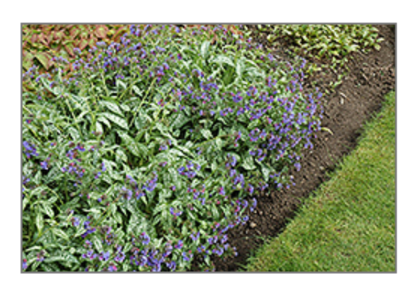
Trevi Fountain Lungwort in bloom

Trevi Fountain Lungwort will grow to be about 12 inches tall at maturity, with a spread of 18 inches. When grown in masses or used as a bedding plant, individual plants should be spaced approximately 15 inches apart. Its foliage tends to remain dense right to the ground, not requiring facer plants in front. It grows at a medium rate, and under ideal conditions can be expected to live for approximately 10 years. As an herbaceous perennial, this plant will usually die back to the crown each winter, and will regrow from the base each spring. Be careful not to disturb the crown in late winter when it may not be readily seen!