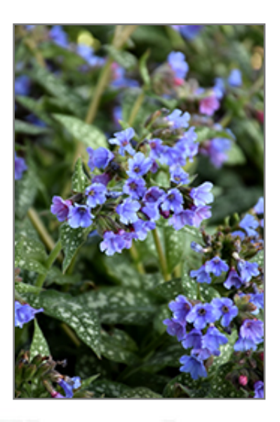
Trevi Fountain Lungwort flowers

Trevi Fountain Lungwort is recommended for the following landscape applications;