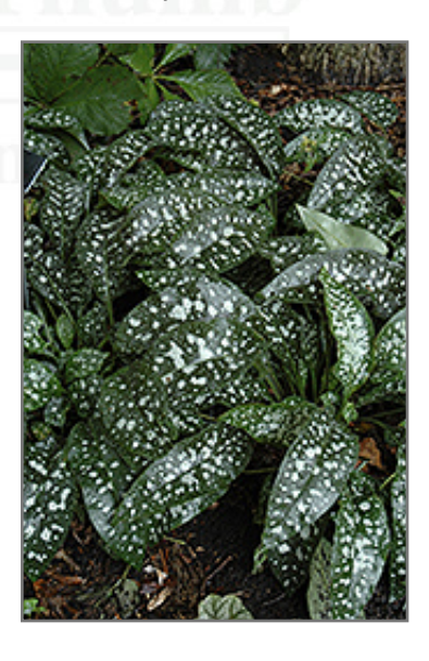
Trevi Fountain Lungwort foliage