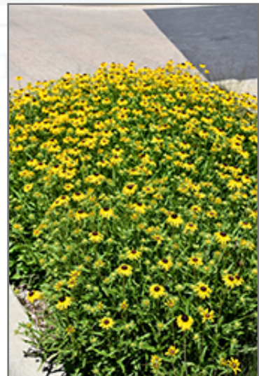
Viette's Little Suzy Coneflower in bloom