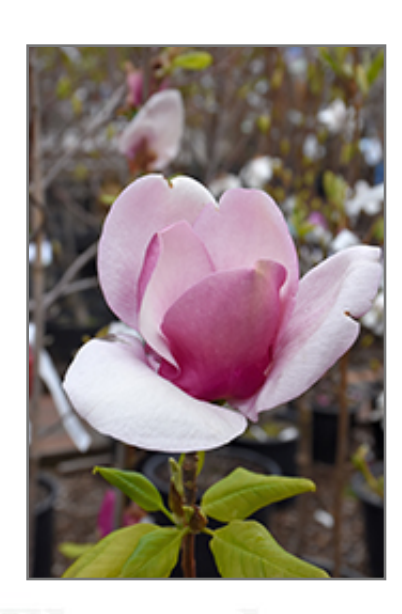
Cameo Magnolia flowers

Cameo Magnolia is bathed in stunning lightly-scented fuchsia cup-shaped flowers with a creamy white reverse held atop the branches from early to mid spring before the leaves. It has dark green deciduous foliage which emerges chartreuse in spring. The pointy leaves turn coppery-bronze in fall.