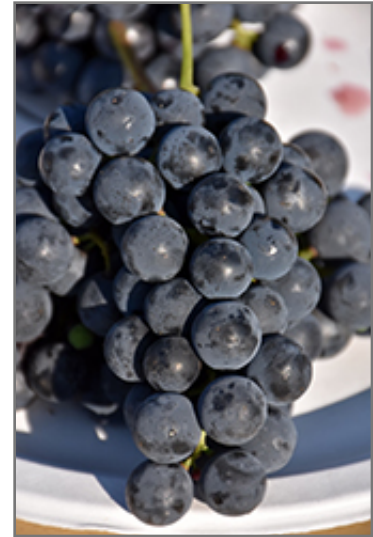
Sabrevois Grape fruit

Sabrevois Grape has rich green deciduous foliage on a plant with a spreading habit of growth. The lobed leaves turn yellow in fall. It produces small clusters of deep purple grapes with navy blue overtones in mid fall.