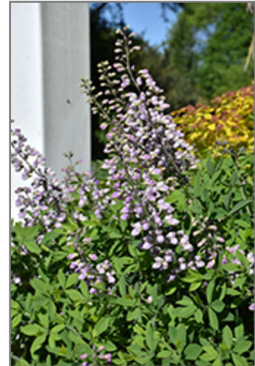
Decadence Deluxe Blue Bubbly False Indigo flowers

Numerous, long, lavender-blue spikes of pea-flowers rise above a tall habit of blue-green foliage in late spring;; use this plant for its outstanding display of vertical flowers, as an accent in the garden or borders; best in full sun