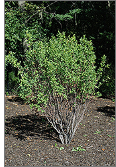
Rainbow Pillar Serviceberry

Rainbow Pillar Serviceberry is a dense multi-stemmed deciduous shrub with a narrowly upright and columnar growth habit. Its relatively fine texture sets it apart from other landscape plants with less refined foliage.