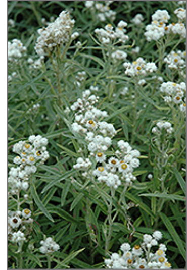
Pearly Everlasting flowers