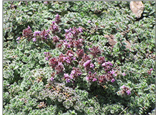
Wooly Thyme flowers

Wooly Thyme is recommended for the following landscape applications;