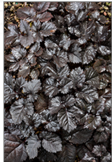
Dark Side Of The Moon Astilbe foliage