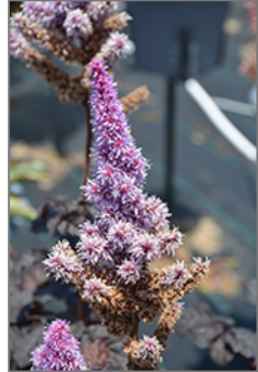
Dark Side Of The Moon Astilbe flowers

Dark Side Of The Moon Astilbe is an herbaceous perennial with an upright spreading habit of growth. Its relatively fine texture sets it apart from other garden plants with less refined foliage.