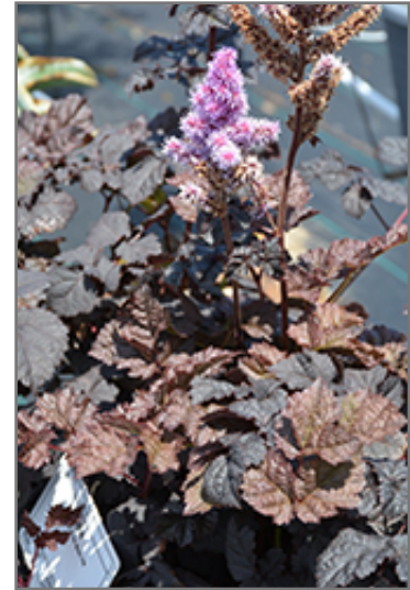
Dark Side Of The Moon Astilbe in bloom

Dark Side Of The Moon Astilbe will grow to be about 18 inches tall at maturity extending to 24 inches tall with the flowers, with a spread of 24 inches. When grown in masses or used as a bedding plant, individual plants should be spaced approximately 20 inches apart. Its foliage tends to remain dense right to the ground, not requiring facer plants in front. It grows at a medium rate, and under ideal conditions can be expected to live for approximately 10 years. As an herbaceous perennial, this plant will usually die back to the crown each winter, and will regrow from the base each spring. Be careful not to disturb the crown in late winter when it may not be readily seen!