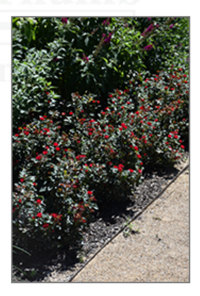
Petite Knock Out Rose in bloom