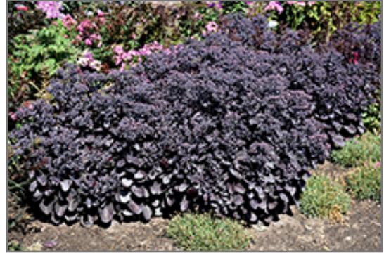
Rock 'N Grow Back in Black Stonecrop in bloom

Rock 'N Grow Back in Black Stonecrop has masses of beautiful clusters of creamy white star-shaped flowers with cherry red eyes at the ends of the stems from late summer to early fall, which emerge from distinctive crimson flower buds, and which are most effective when planted in groupings. The flowers are excellent for cutting. Its attractive large succulent round leaves emerge burgundy in spring, turning black in colour with showy dark gray variegation and tinges of coppery-bronze throughout the season. The deep purple stems are very colorful and add to the overall interest of the plant.