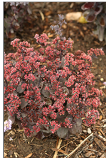
Rock 'N Grow Back in Black Stonecrop flowers