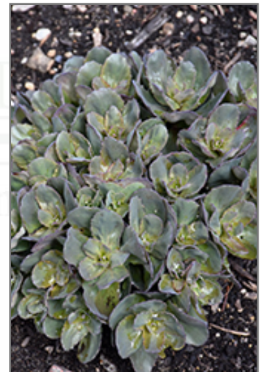
Rock 'N Grow Back in Black Stonecrop foliage