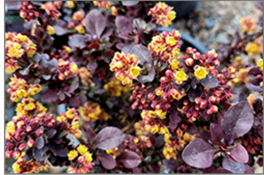
Concorde Japanese Barberry flowers

Concorde Japanese Barberry will grow to be about 18 inches tall at maturity, with a spread of 24 inches. It tends to fill out right to the ground and therefore doesn't necessarily require facer plants in front. It grows at a slow rate, and under ideal conditions can be expected to live for approximately 20 years.