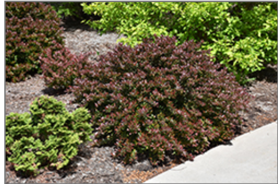
Concorde Japanese Barberry