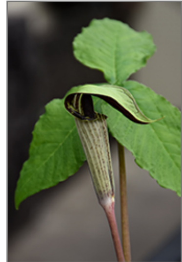
Jack-In-The-Pulpit flowers