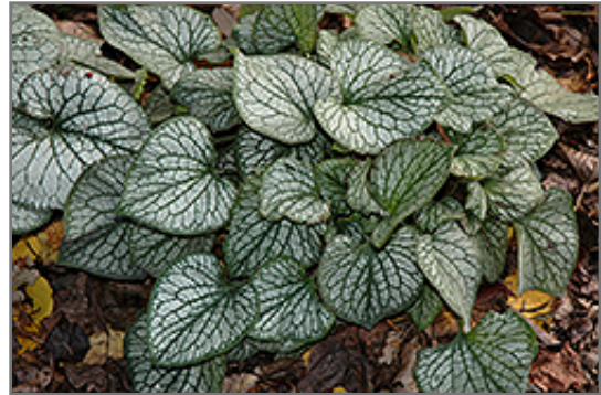
Jack Frost Bugloss foliage

Jack Frost Bugloss is an herbaceous perennial with a mounded form. Its relatively coarse texture can be used to stand it apart from other garden plants with finer foliage.