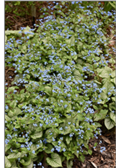
Jack Frost Bugloss in bloom

Jack Frost Bugloss is a fine choice for the garden, but it is also a good selection for planting in outdoor pots and containers. It is often used as a 'filler' in the 'spiller-thriller-filler' container combination, providing a mass of flowers and foliage against which the thriller plants stand out. Note that when growing plants in outdoor containers and baskets, they may require more frequent waterings than they would in the yard or garden. Be aware that in our climate, most plants cannot be expected to survive the winter if left in containers outdoors, and this plant is no exception. Contact our experts for more information on how to protect it over the winter months.